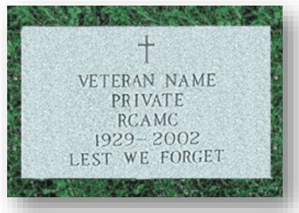
Flat barre grey granite