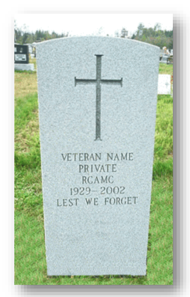
Upright barre grey granite